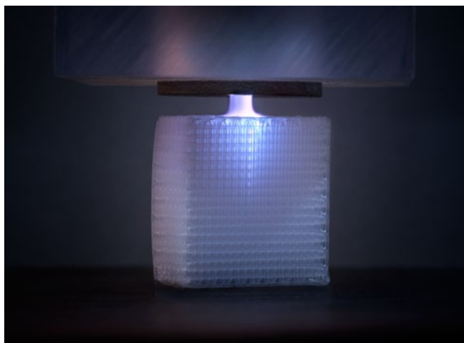
Plasma-jet coating of medical implant scaffolds.